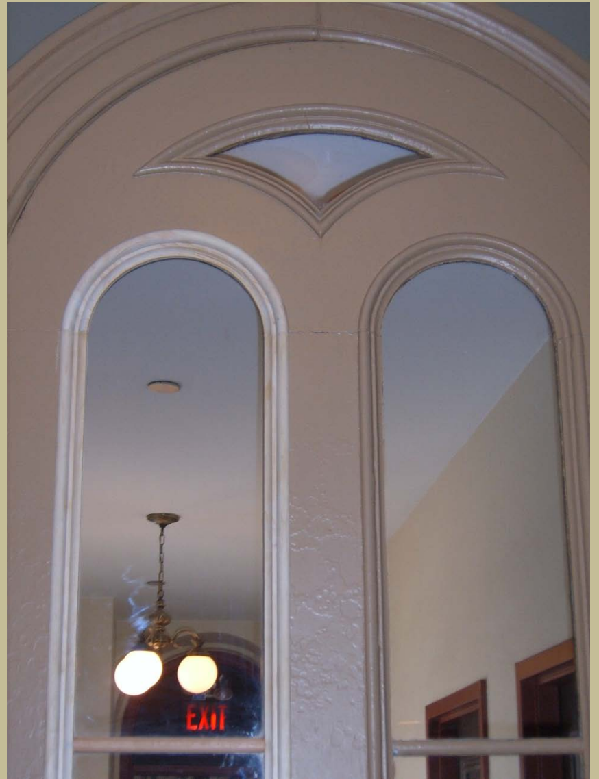
Heritage Mill Historic Building Conservation