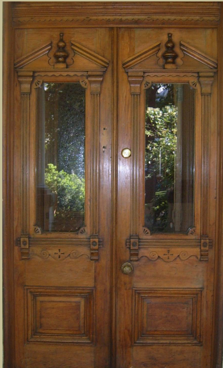
Heritage Mill Historic Building Conservation