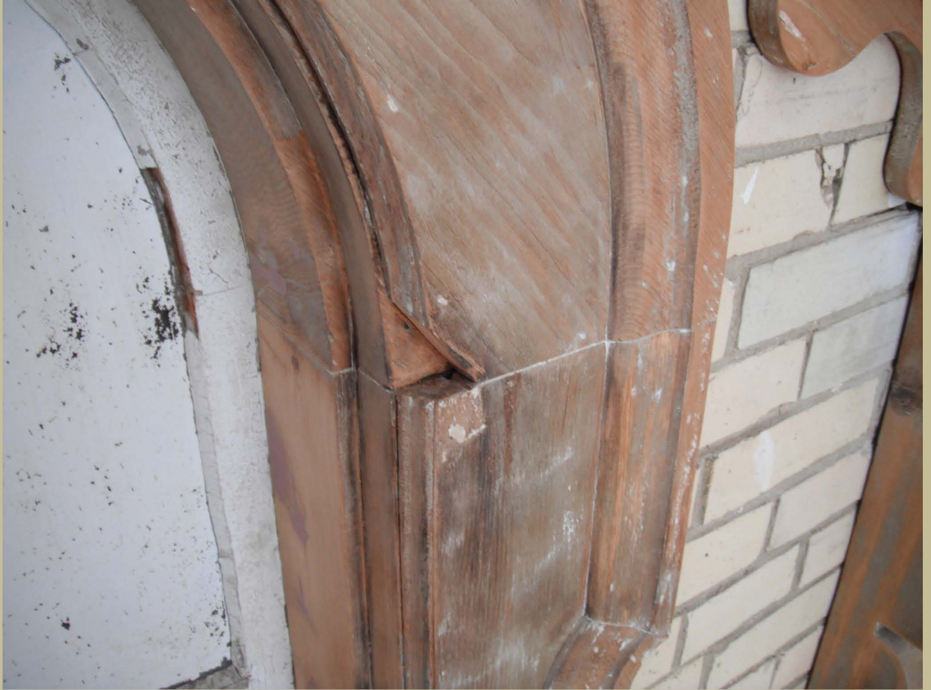
Heritage Mill Historic Building Conservation