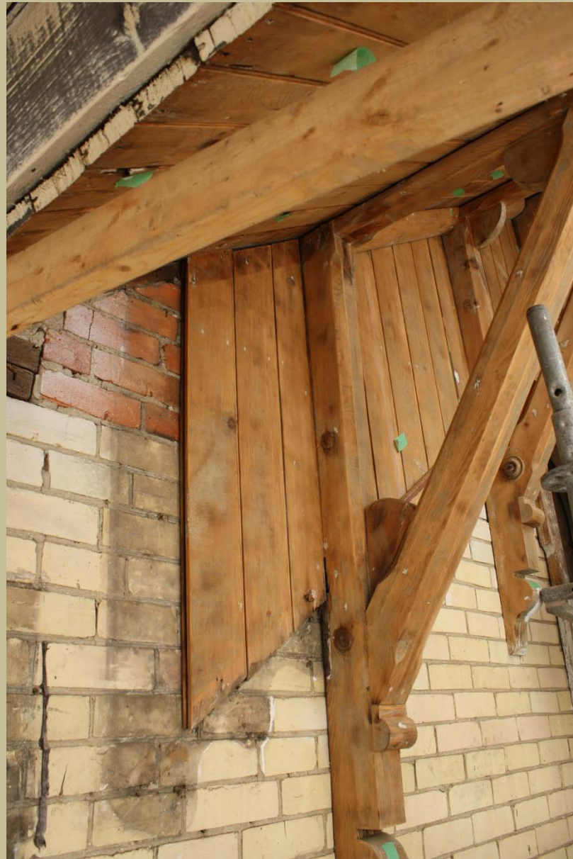
Heritage Mill Historic Building Conservation