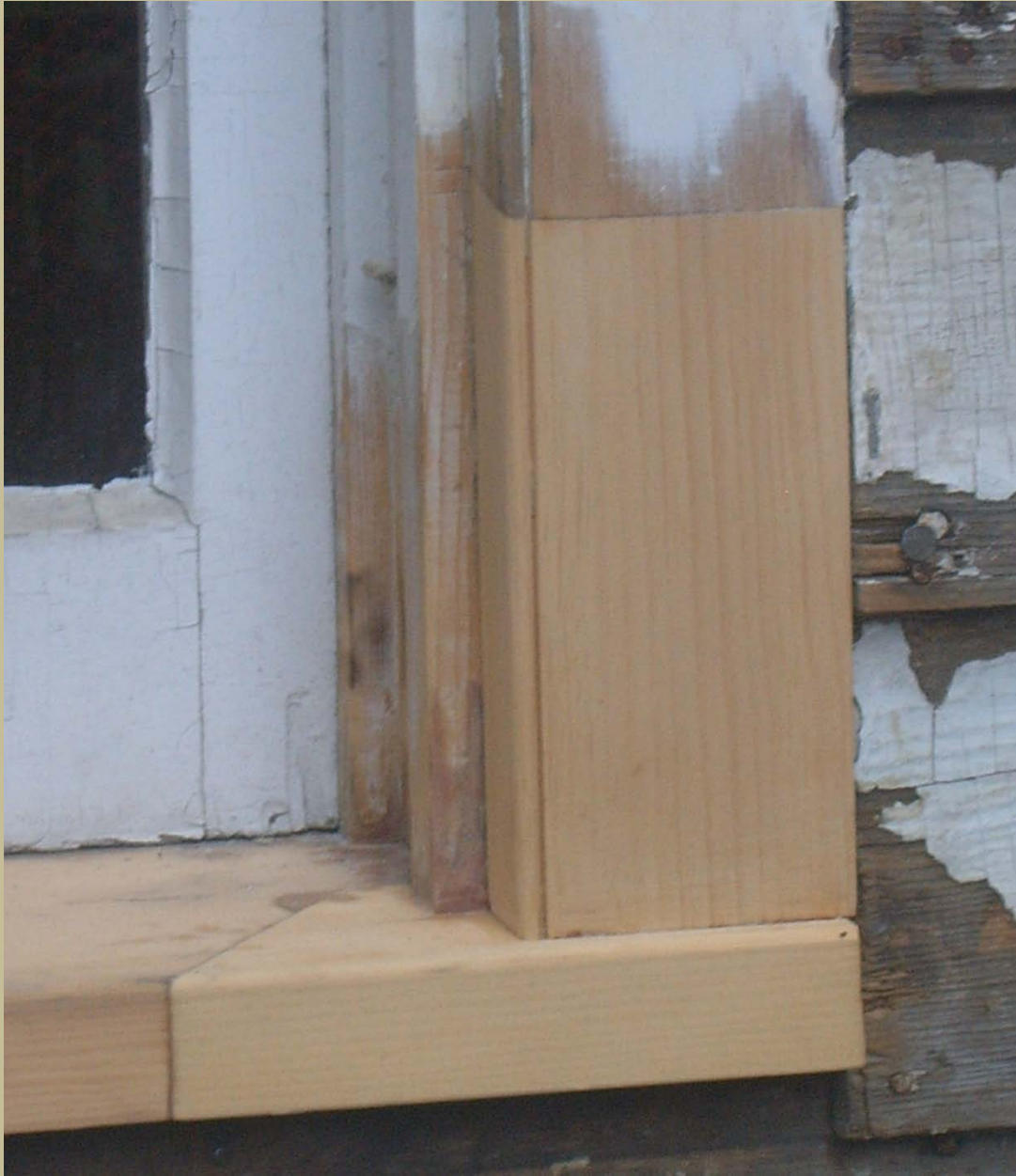
Heritage Mill Historic Building Conservation