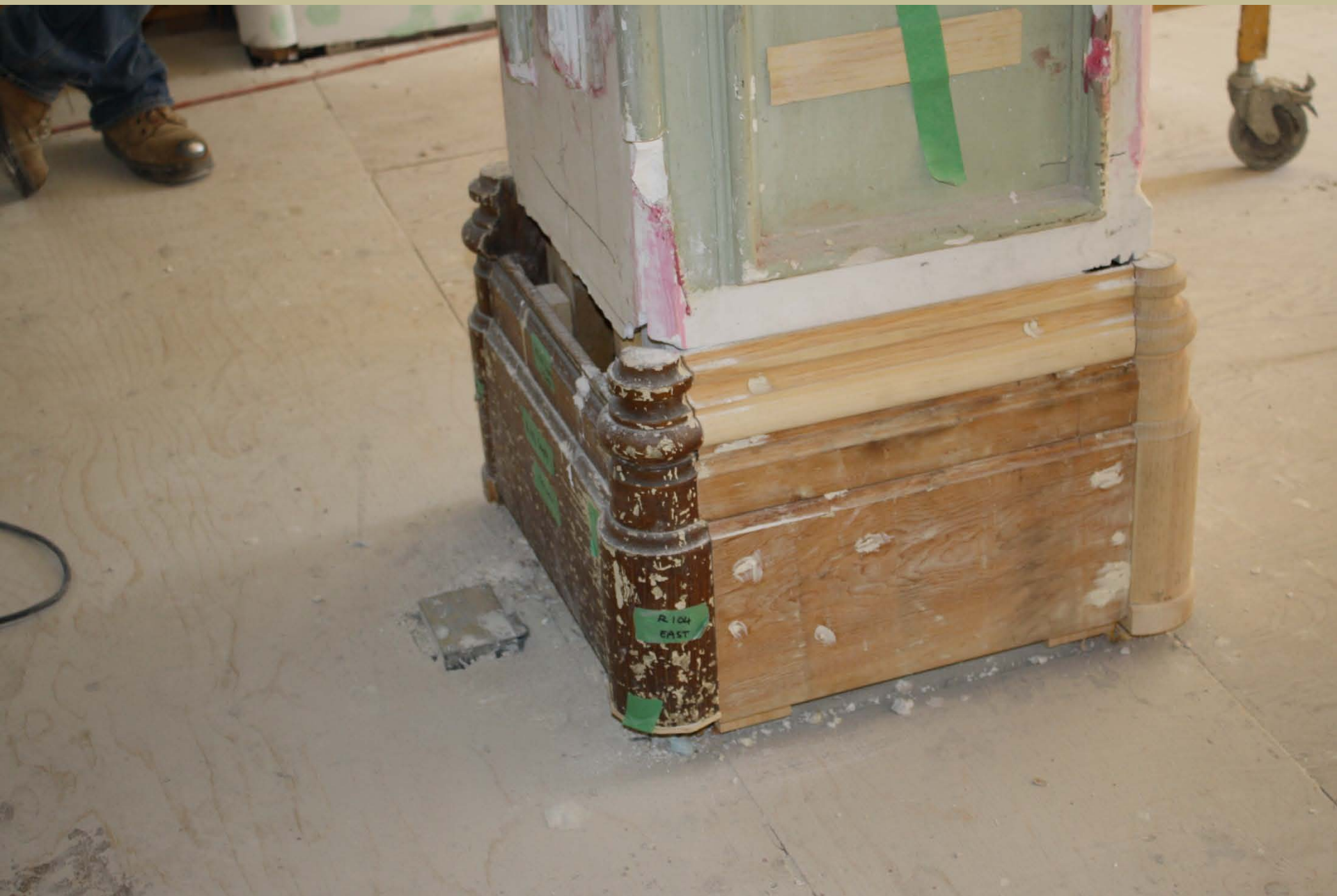
Heritage Mill Historic Building Conservation