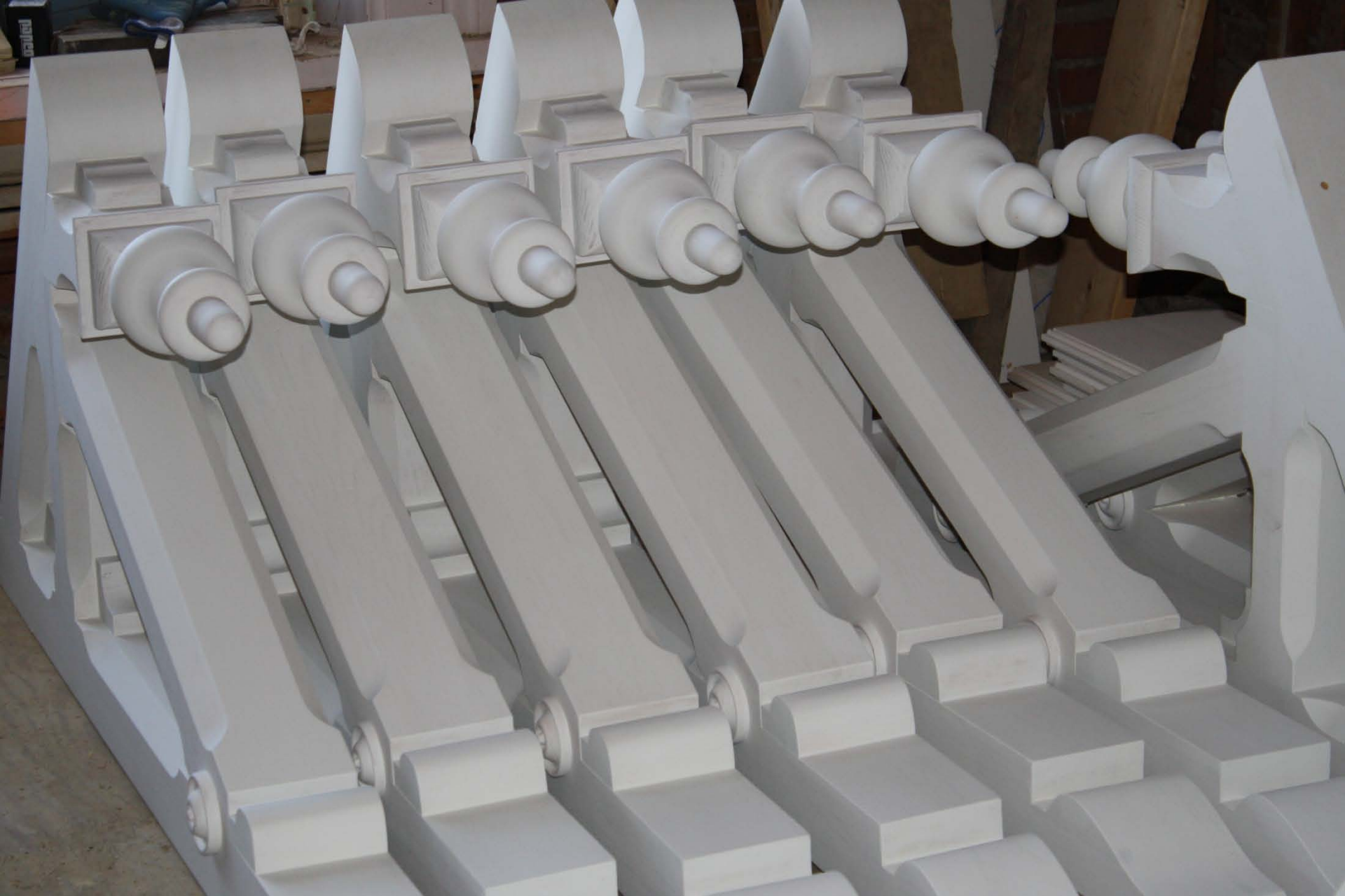
Heritage Mill Historic Building Conservation