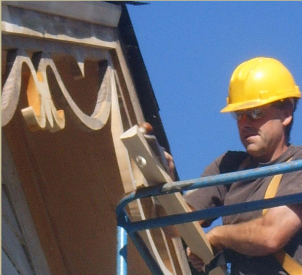
Heritage Mill Historic Building Conservation