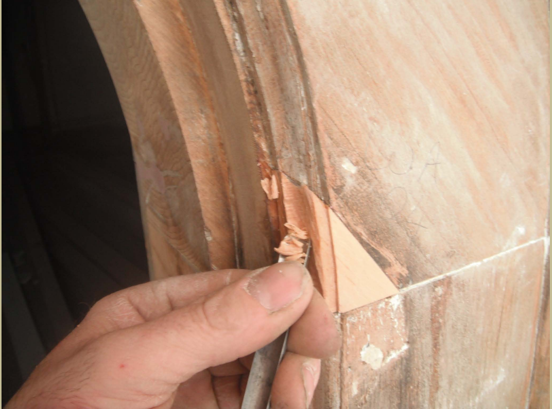
Heritage Mill Historic Building Conservation