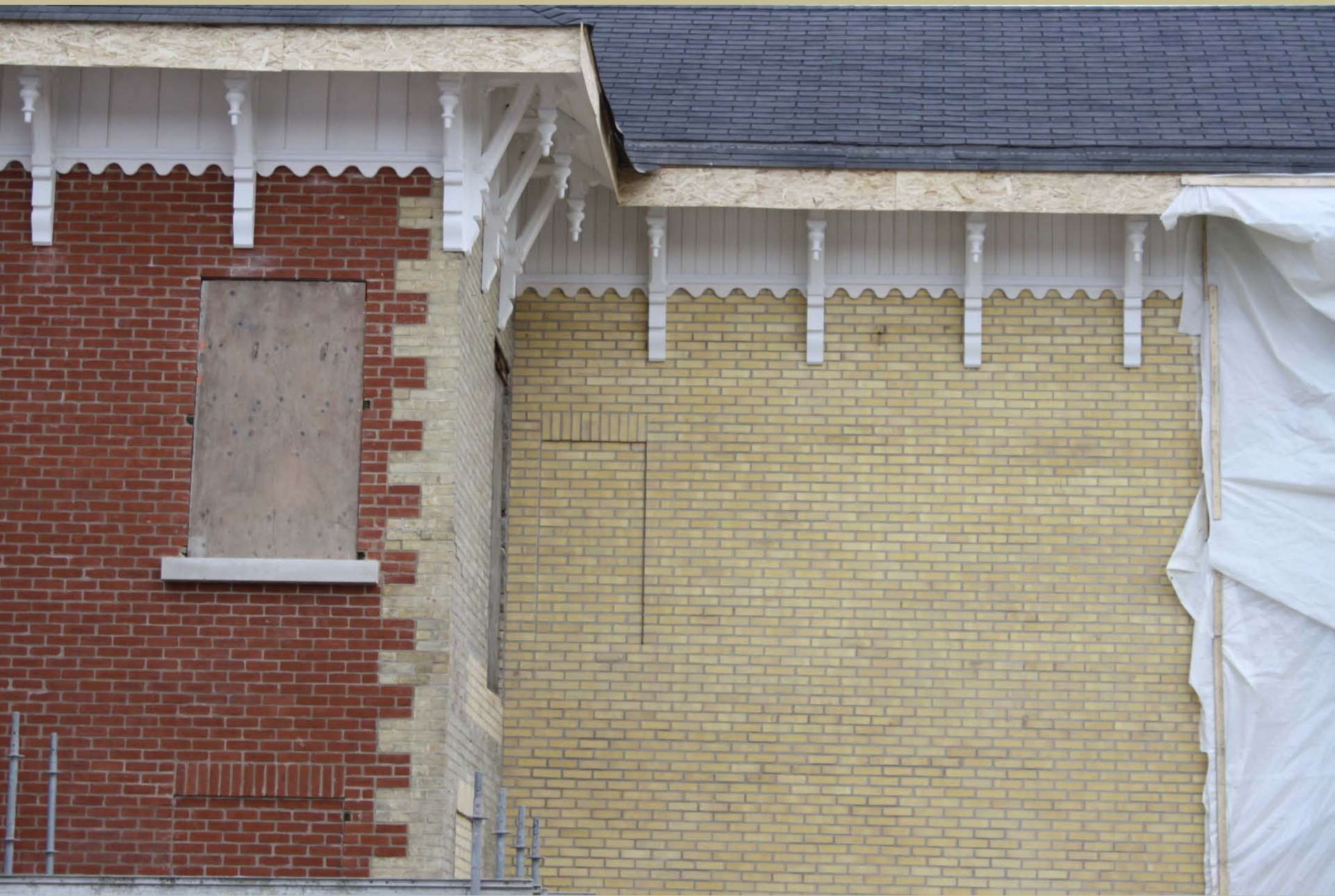
Heritage Mill Historic Building Conservation