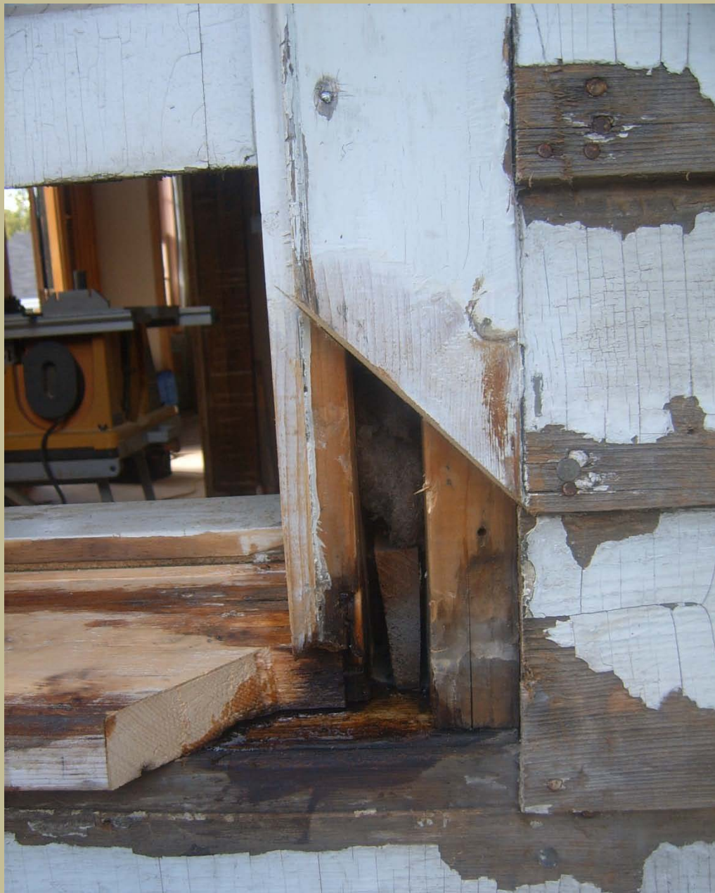
Heritage Mill Historic Building Conservation