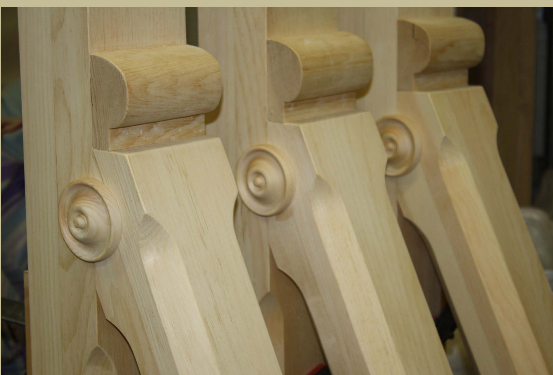
Heritage Mill Historic Building Conservation