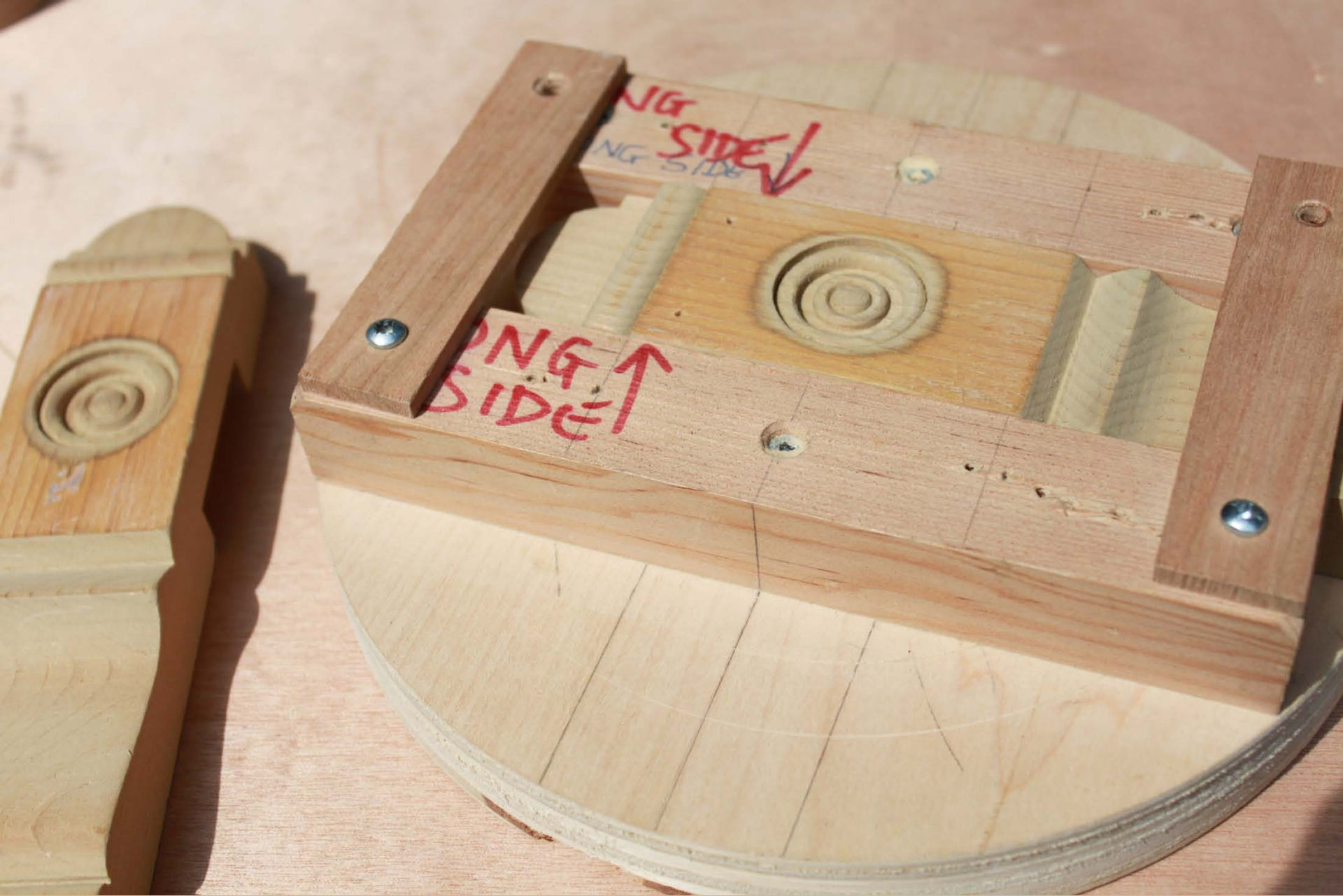
Heritage Mill Historic Building Conservation