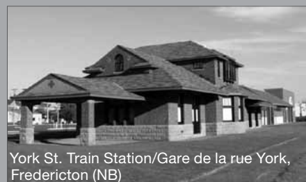
York St. Train Station/Gare de la rue York, Fredericton (NB)