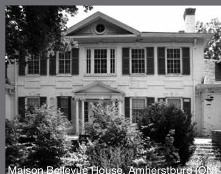
Maison Bellevue House, Amherstburg (ON)