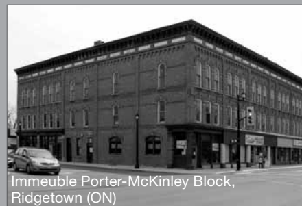
Immeuble Porter-McKinley Block, Ridgetown (ON)