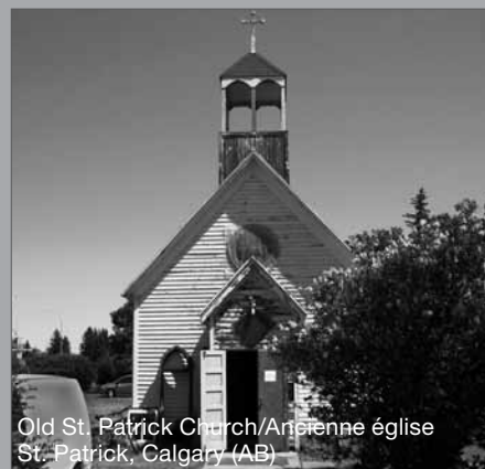
Old St. Patrick Church/Ancienne église St. Patrick, Calgary (AB)